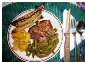
With Delight in the Daily, Diane

A bonus from sharing our gardens: great healthy meals, less shopping.