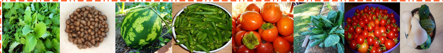
Turnip Greens ~Harvesting